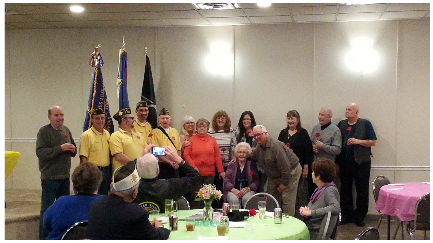
Great photo of the Vet & Lady of the year past.