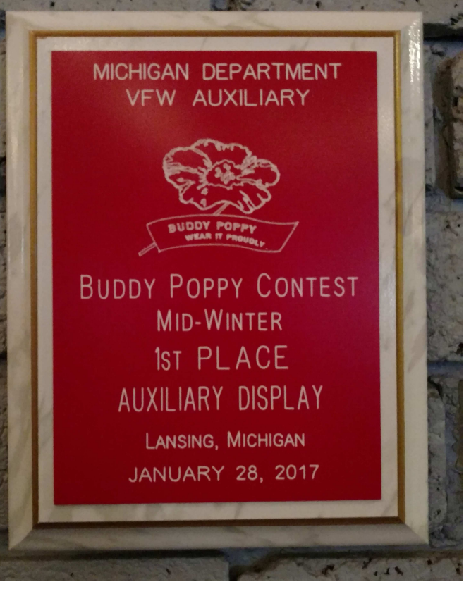
Plaque that our Post won thanks to our Aux Members hard work.